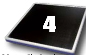
DR 4300 Flat Panel Digital Navigator Retrofit