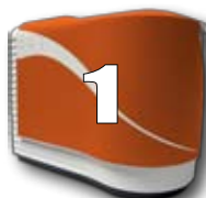
CR 2000 Portable Digital Navigator