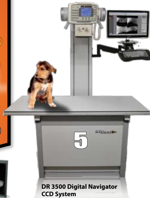
DR 3500 Digital Navigator CCD System

Choose your digital modality at your special price and select one of the imaging products below absolutely FREE!