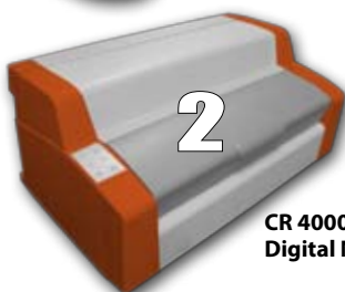
CR 4000 Portable Digital Navigator