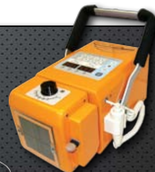
Ultra 120kV Digital Portable X-ray Unit