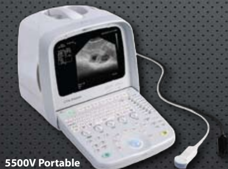
5500V Portable Ultrasound