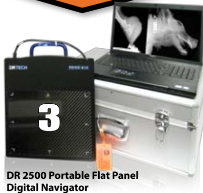
DR 2500 Portable Flat Panel Digital Navigator