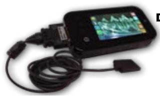
DR MiniView Dental Option