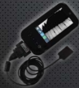
DR MiniView Portable Digital Dental Imager