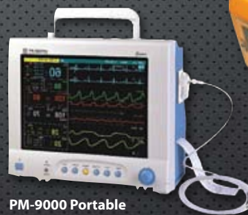
PM-9000 Portable Patient Monitor